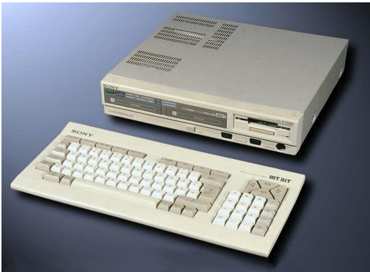
The Sony HB-F700P/D MSX-2 computer.